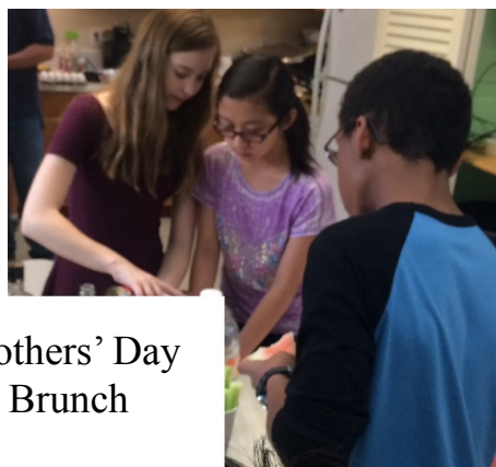
Mothers' Day Brunch